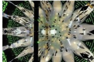
Photo Highlight Slideshow People are reflected on the ceiling of Samsung's stand at the International Consumer Electronics Trade Fair in Berlin.